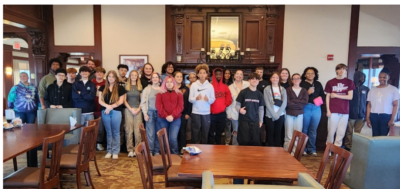
Kokomo Area Career Center