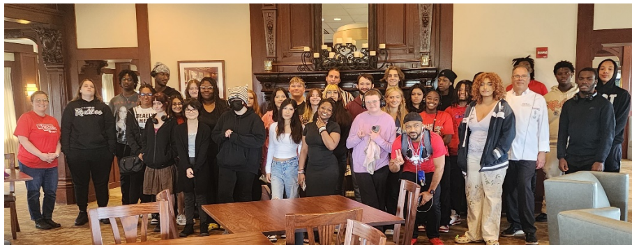
Rochester High School

The Ivy Tech Hospitality Administration program offers dual credit agreements through 27 high schools and career centers in central Indiana, plus additional rural areas. There are 150 dual credit Culinary/Hospitality classes being taught by 44 credited and approved high school teachers. Ivy Tech's dual credit programming reaches over 3,000 high school students; bringing college coursework to their classrooms while strengthening the pipeline for future students in our Ivy Tech program.